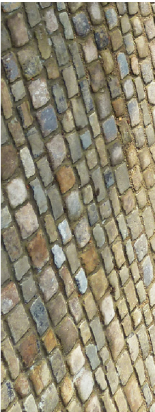
7. Historic Features & Function