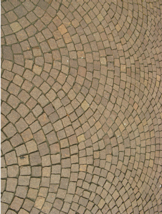
3. Pattern - fanned sets