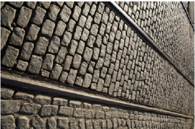
6. Safe Environment with Architectural Railings