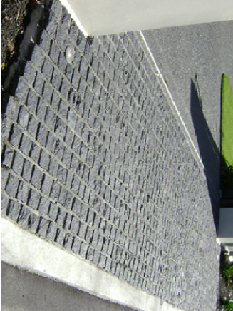
4. Changing Zones - Pedestrian to Vehicular