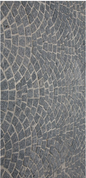
9. Quality Materials enhancing the Listed Building settings