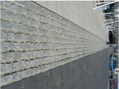
8. Dividing open functional space