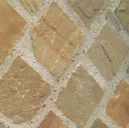
5. Tie In - Conservation Area Materials

Key Aspirations and Functions During the Inception Meeting the following key aspects were recorded and have become part of the options design: