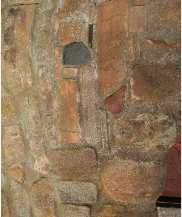
2. Conservation Area and Local Context to be reflected aesthetically