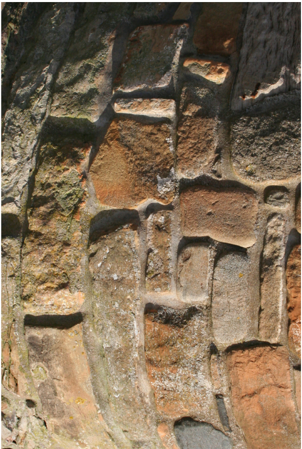
1. Existing Local Stone Wall Example