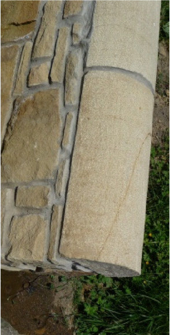
3. Example of Natural Stone Coping shape for use on all walls within The East Slip area.